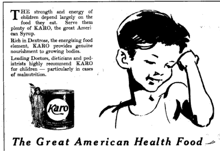
Figure 6. Karo ad in the Fairfield Ledger , Nov. 17, 1927. 50

Interestingly, corn farmers went silent about corn sugar labeling in 1927 and 1928. Manufacturers increasingly bought up corn sugars for cattle feed, rayon, synthetic rubber, explosives, tanning, and food additives such as citric acid and riboflavin. Corn sugar production jumped by nearly 400,000 pounds from 1925 to 1927, increasing nine-fold from 1920 to 1929. Illegal but profitable uses for corn likely also help explain farmers' sudden lack of interest in labeling fights. Prohibition Commissioner James Doran estimated that ninety-five percent of illegal whiskey was made with corn sugar from the "bone-dry" Midwest. After the 1929 Jones Act strengthened federal penalties for bootlegging, one corn sugar producer reported a twenty-five percent drop in orders. 51